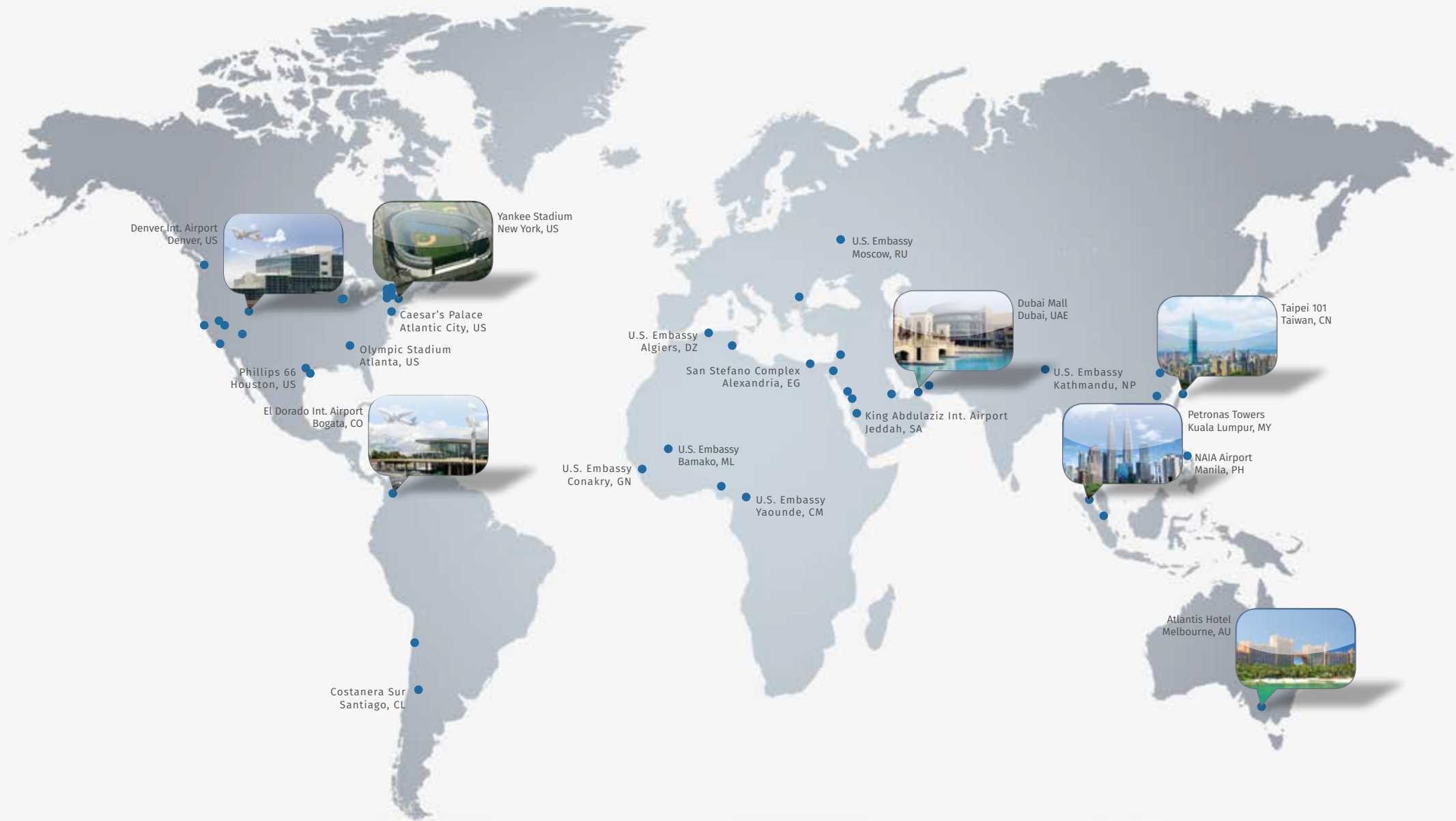
This map represents a partial list of our high profile, mega projects.