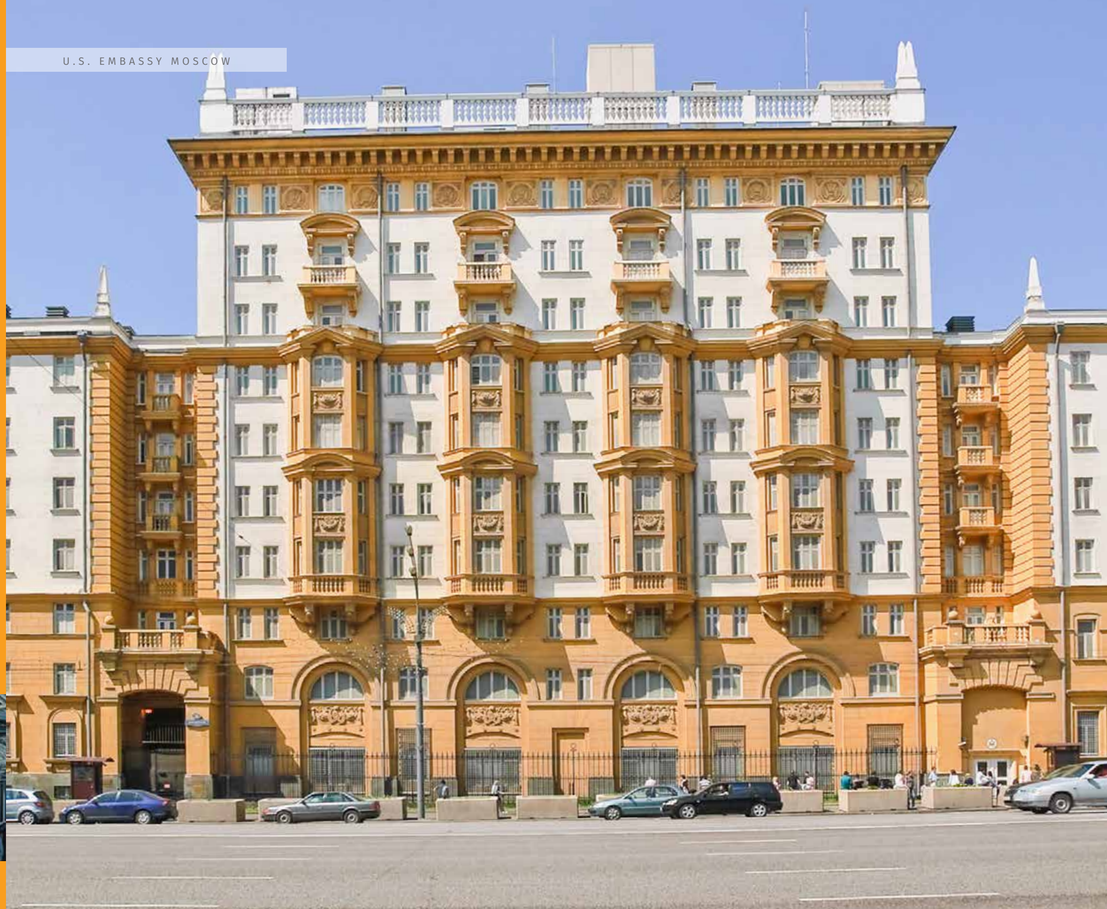
U.S. EMBASSY MOSCOW